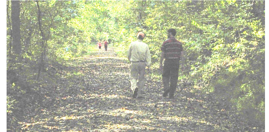
Deep River Rail Trail - Franklinville, NC

The Piedmont Triad has a growing list of trails to hike, bicycle, walk, run, trot or just stroll. Communities across the region are choosing to invest in trail development to: