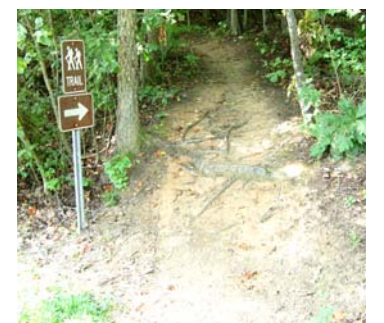
Watershed Trails - Greensboro, NC

The Mountains to Sea, Deep River and Yadkin River Trails are three State designated facilities that cross through the Piedmont Triad. Though these trails are not fully built out in the region, local, regional and State agencies have developed plans in recent years to complete these trail systems. If you would like more information about these planning efforts, please contact the Piedmont Triad Regional Council Planning Department at 336 294-4950 or email jday@ptrc.org .